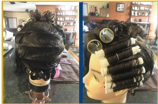
(left): Shampoo is used in place of gel for the fingerwaves.