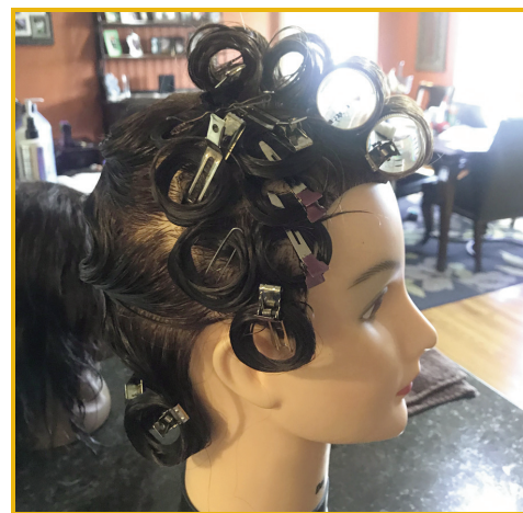
A paperclip and bobby pin are used to secure pin curls and rollers